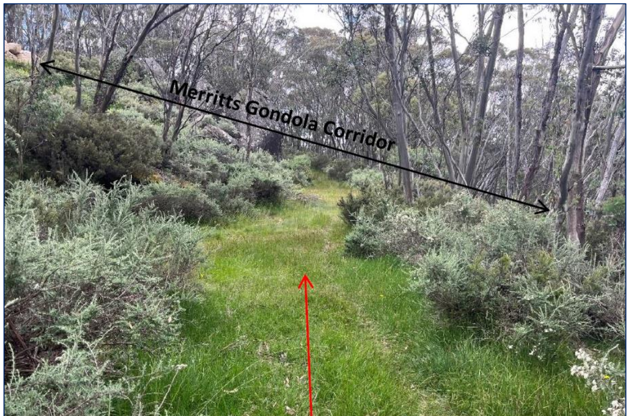
Figure 2 | Section of proposed track identifying disturbed land

As discussed in Section 1 , the proposed site is predominantly disturbed land requiring minimal vegetation clearing ( Figure 2 ), which would be limited to the removal of understory and ground cover of the native Alpine Snow Gum. Additional trimming of overhanging tree limbs and brush cutting on the edges of the track would also occur as required.